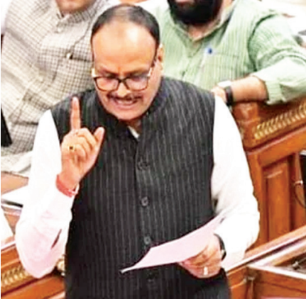
you once again that we must adopt a mantra in our lives: whatever we buy will be 'Made in India', it will be indigenous. I appeal to the citizens of our country to prioritise purchasing goods that are 'Made in India'. Whether it's decorative items or gifts, let us choose products manufactured within our own

goods during festivals like Navratri, Vijayadashami, Dhanteras, and Diwali would contribute to the country's self-reliance and economic progress. Addressing a public gathering after inaugurating and laying the foundation stone for multiple development projects in Ahmedabad, the Prime Minister reiterated his call for 'Swadeshi', appealing to both businesses and individuals to opt for locally manufactured items to drive national prosperity. This is the season of festivals. Now Navratri, Vijayadashami, Dhanteras, Diwali... all these festivals are coming. These are celebrations of our culture, but they should also be celebrations of self-reliance. Therefore, I want to reiterate my request to