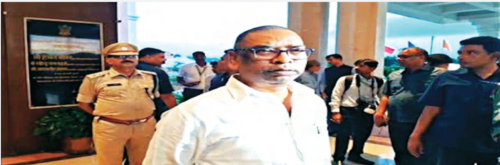
in his statement that the Vote Adhikar Yatra has created fear among BJP and NDA. Monday