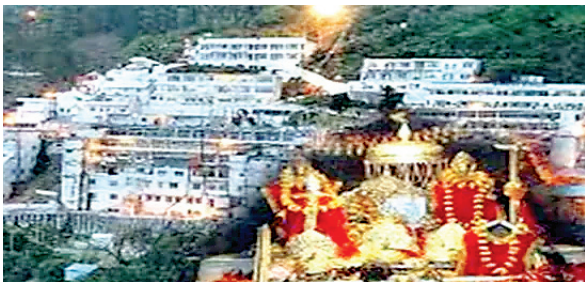
The pilgrimage was postponed on August 26 after a

Jammu. The pilgrimage to Mata Vaishno Devi temple in Reasi district of Jammu and Kashmir has been postponed again till further orders due to continuous rain. The Shrine Board gave this information on Saturday. The pilgrimage to Mata Vaishno Devi temple was to resume on Sunday after being suspended for 19 days.