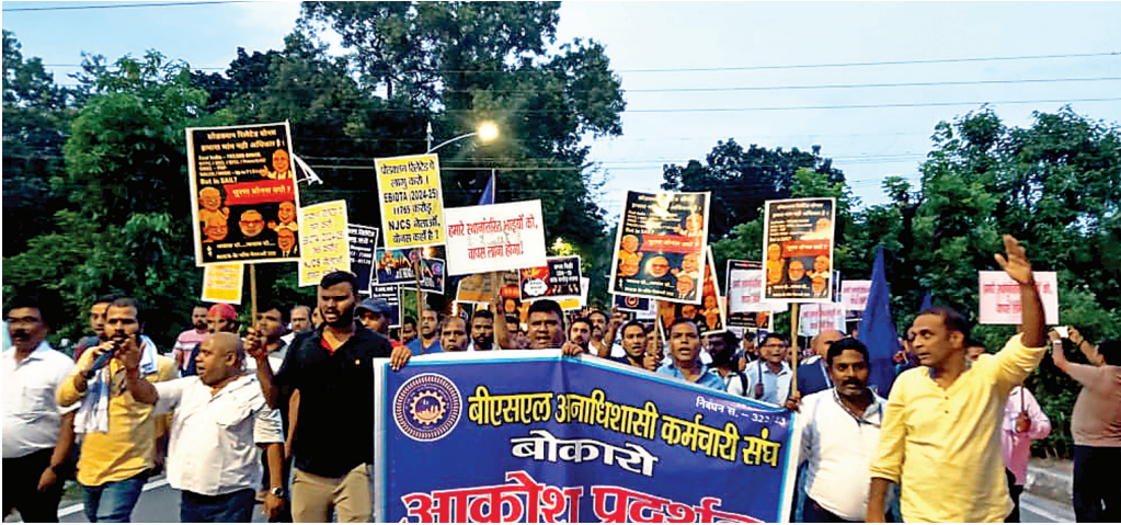
meeting at the Two Tank protest site. A large number of BSL workers participated,

DB Reporter Bokaro: Employees of Bokaro Steel Plant (BSL) staged a massive protest under the banner of the BSL Anadhishasi Karmachari Sangh, expressing strong resentment against the implementation of the ASP-LIS bonus formula and demanding the introduction of a production-related pay system. The protest rally began at Mazdoor Maidan in Sector 4 and passed through Gandhi Chowk, culminating in a