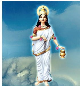
Navratri 2025 day 2: Goddess Brahmacharini

Maa Brahmacharini is the Goddess of Penance, the second form of Goddess Durga worshipped on the second day of Navratri. Her name, derived from "Brahma" (penance) and "Charini" (a female follower), signifies one who undertakes penance. Worshipped to gain strength, wisdom, self-control, and success, she is depicted as pure, serene, and often holding a rosary and kamandal (water pot). Her story involves the arduous austerities performed by Goddess Parvati to marry Lord Shiva, during which she subsisted on fruits, flowers, and eventually even lived without food and water.