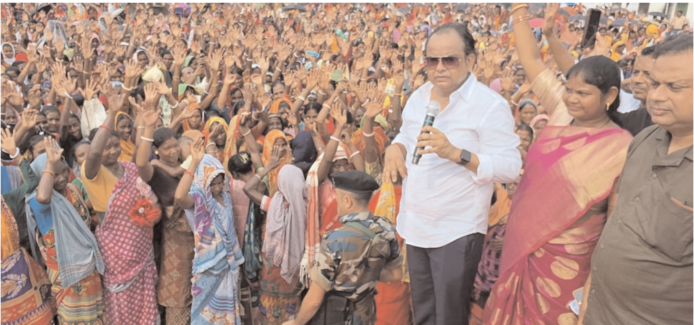
Additionally, women were provided financial support to celebrate the festival with